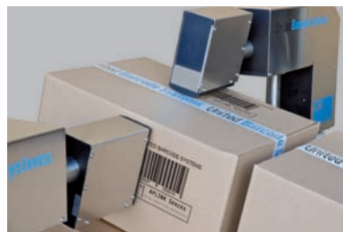
Side Package Printing