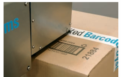
Top Package Printing